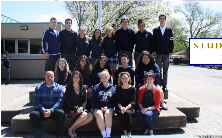
STUDENT COUNCIL 2016-2017