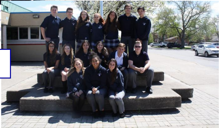
STUDENT COUNCIL 2017-2018